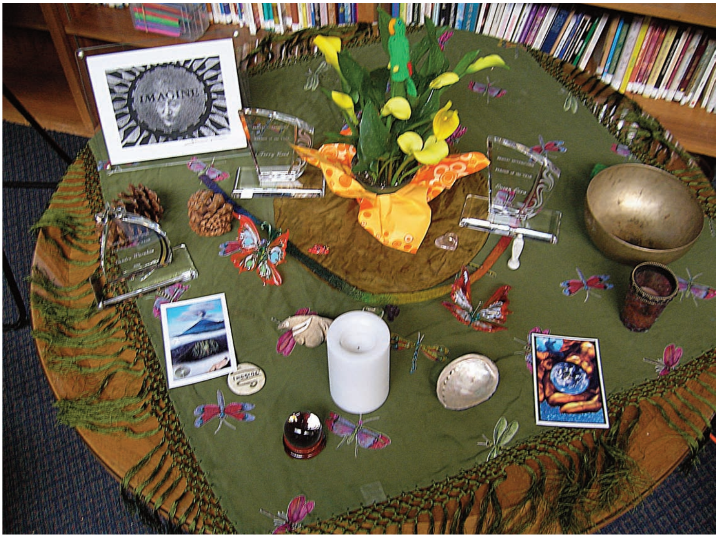
Here you can see our beautiful altar with various offerings from conference attendees who shared the sacred space.