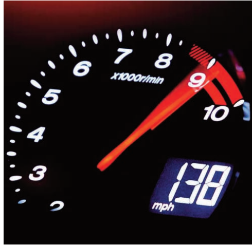
Image of a tachometer popped into my head. I decided to use the idea of a tachometer as a metaphor to help with self awareness.

The second meeting he was again very agitated and needed to talk. When he mentioned his interest in classic cars and motorcycles, an