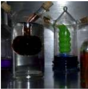
Rie Schore Who Knows No Borders Wood, glass bottles, ink, and t 12"x12" $0