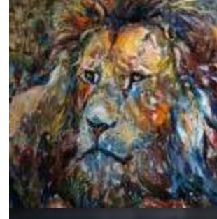
Rosa Katzenelson The Lion of Av Oil on Canvas 22" x 28" $36000