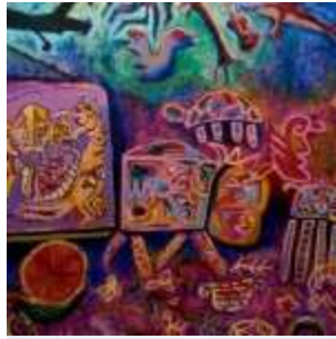
Uzi Silber Carried Away Acrylic on Canvas 72"x48" $12000